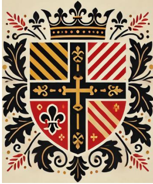
AI generated Image, 2025